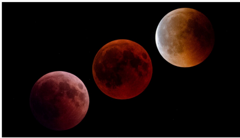
During a “total” lunar eclipse, the moon will remain partially visible in the sky but take on a dark red hue.

Pollution spewed by Anak Krakatau's eruption in Indonesia may darken an already red moon